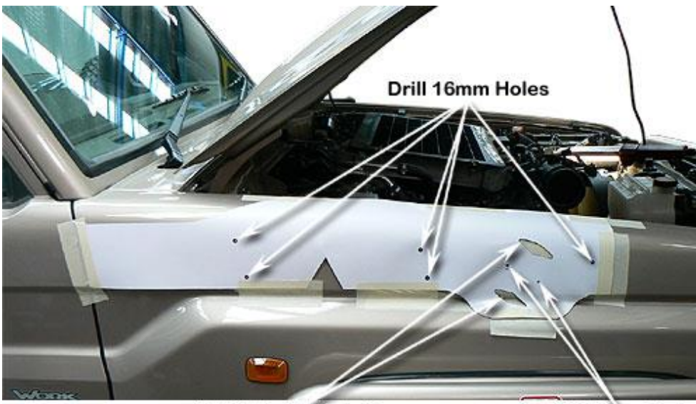
Cut With Air Body Saw

Drill the 5 mounting hole positions to 16mm with a step drill. Deburr and paint holes to prevent rust.